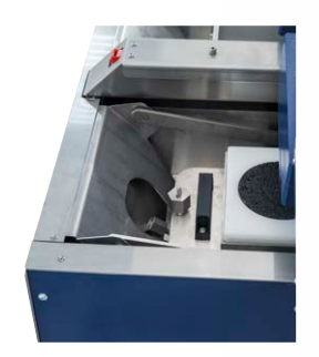
Unique system to load-unload the mould