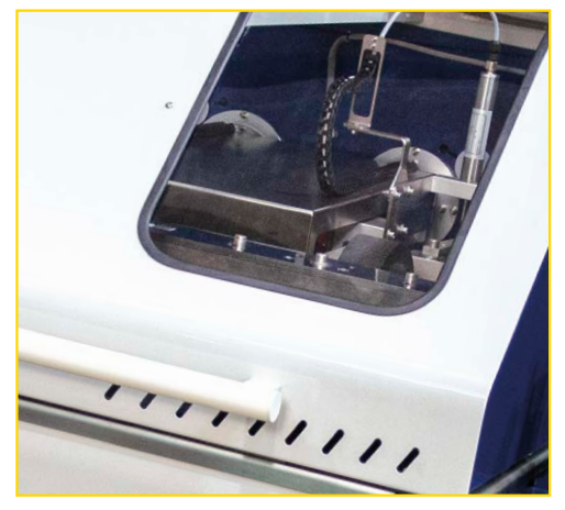
Inspection windows cover