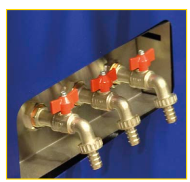
Taps for easy emptying of tanks