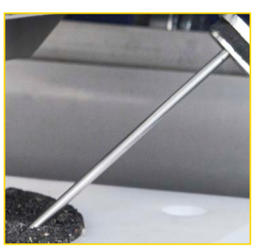
Probes for reading the specimen temperature