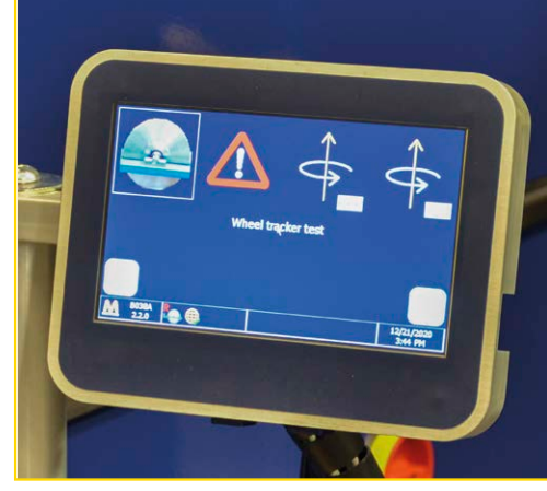
A touch-screen monitor with user-friendly interface