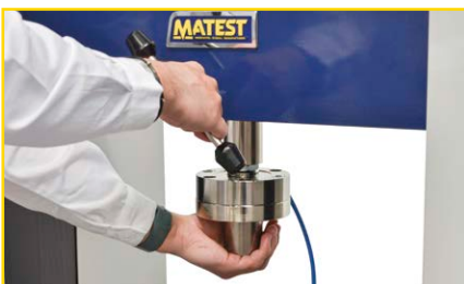
Removable pin for fast replacement of accessories