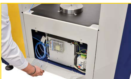
Opening door for better access and easy maintenance