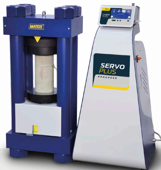
SERVO-PLUS + C125M/A150M