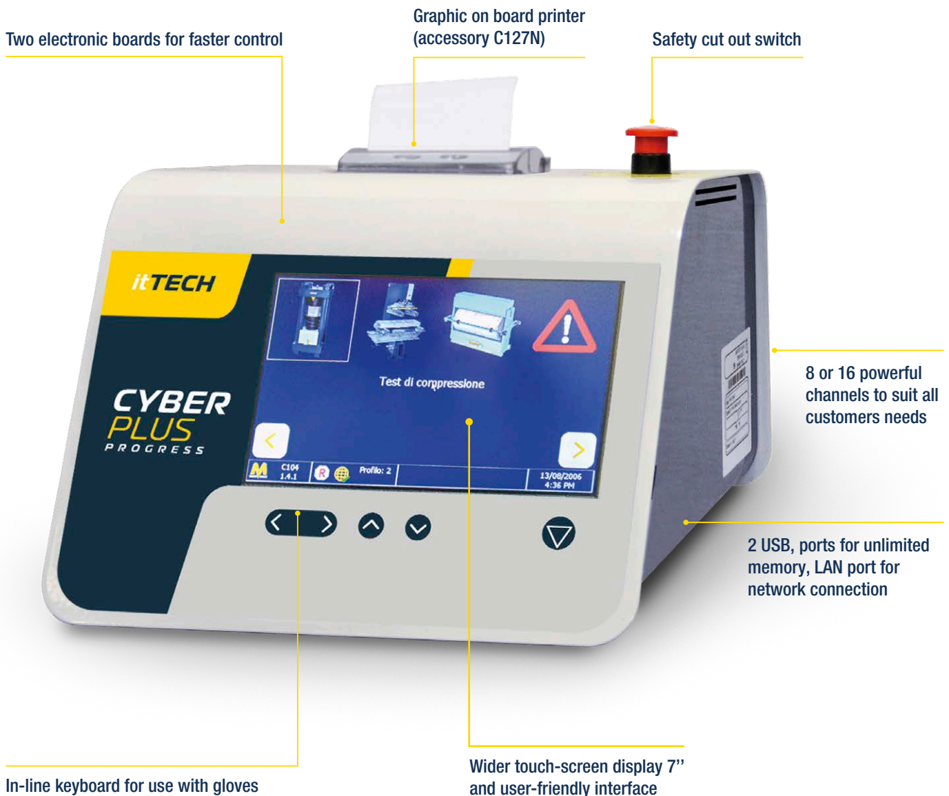
In-line keyboard for use with gloves