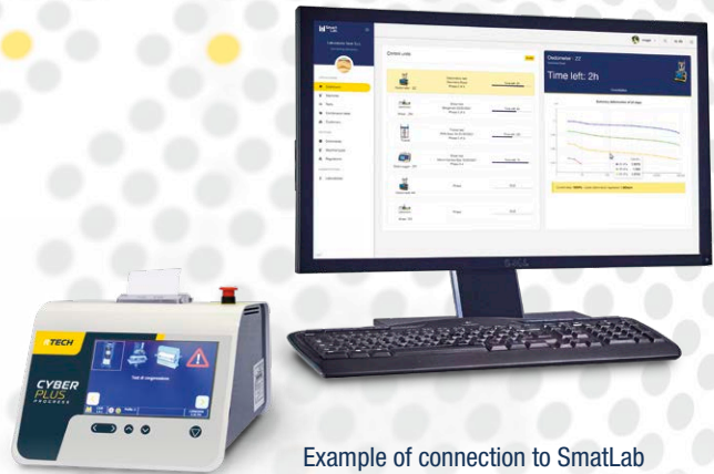
Example of connection to SmartLab

Trough IP address working mode, user defined or DHCP automatically assigned, Cyber Plus Progress communicates and transmits directly to your computer and company server via ethernet, allowing simple retrieval of local test files or full remote control through Matest PC softwares and data export to Microsoft Excel.