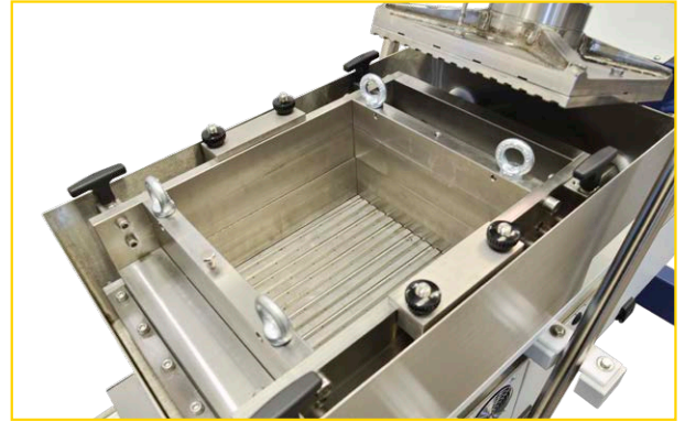
Mould 300x300x150 mm