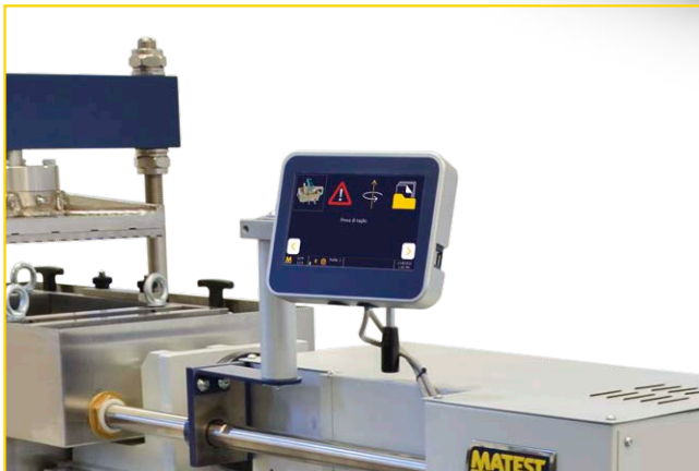
Configurable test from the display.