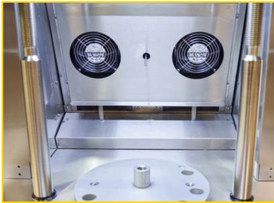
Powerful re-circulation fans.