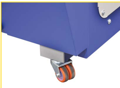
4 wheels for an easier placement and movement.