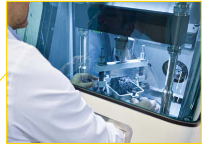
The small door offers easy access to the chamber without temperature dispersion.