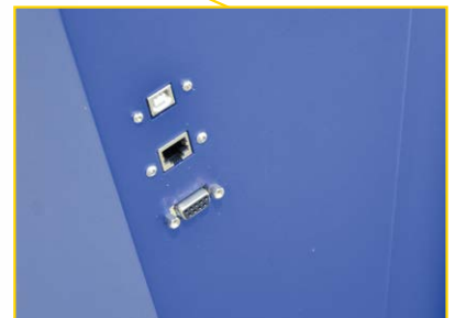
Ethernet, USB type B and Serial ports for connection.