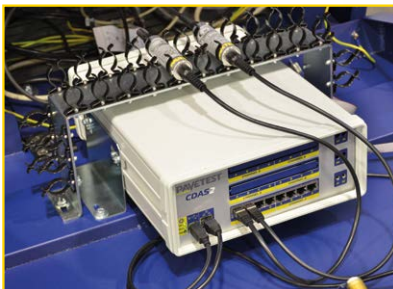
Control and Data Acquisition System located underneath the testing chamber.